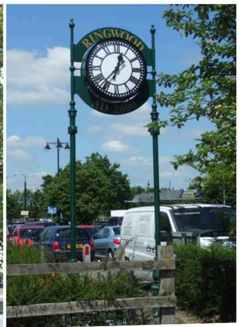
Top: Double pillar with a 3 dimensional Stork on top Bottom left: Double pillar with cast finials and signage panels Bottom middle: Double sided drum between two posts Bottom right: Double pillar with top and bottom signage fins